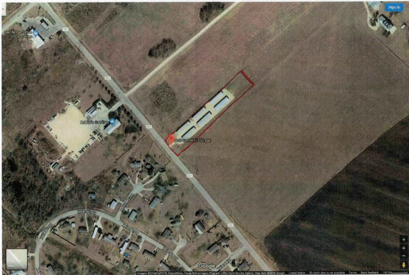
Google Aerial Map